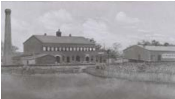
Kennesaw Avenue Factory, just north of the Marietta Square, housed the Brumby Chair Company from 1875 to 1945.