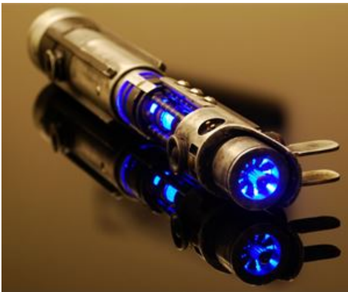
Police Urge Americans To Carry This With Them At All Times