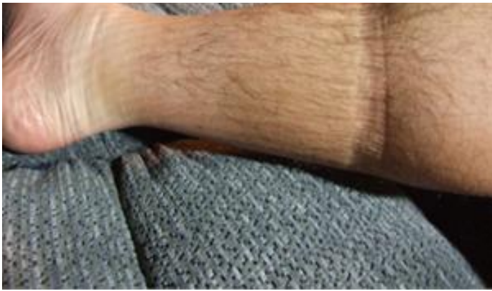
4 Major Heart Attack Red Flags — Are You At Risk?