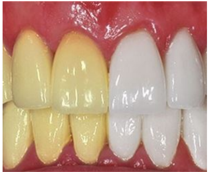
Brilliant New Device To Whiten Teeth In Minutes