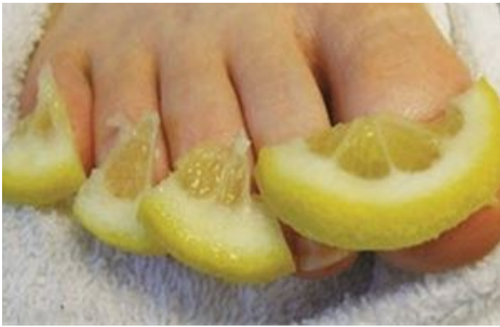
Watch: Toenail Fungus Destroyed My Life, Until I Found This