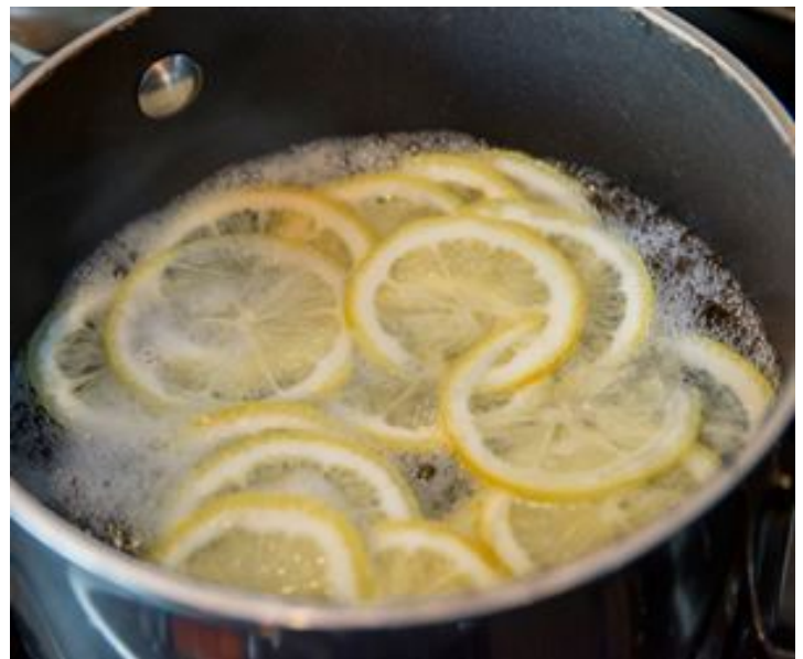
How To Fix Your Fatigue And Get More Energy