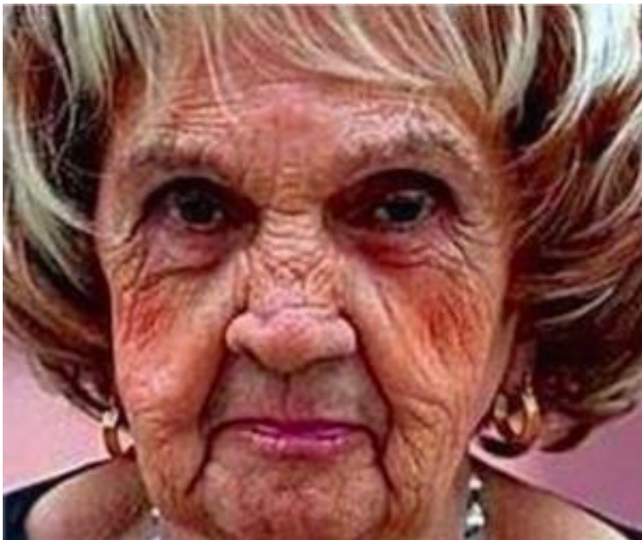
62Year Old Wife Surprises Husband, Cries After Sees Makeover