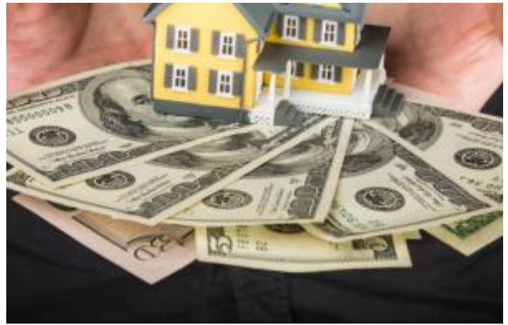
The Time to Refinance Your Home Is Now